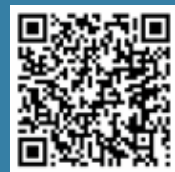
Inspire Health Referral Information

Appointment availability typically within 3-5 days.