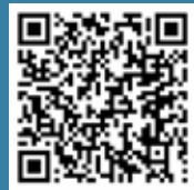
Inspire Health Referral Information

Internal Medicine Referral Fax 833.973.5631