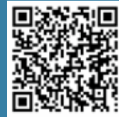
Inspire Health Referral Information

Downloadable Fax Referral Form inspirehealth.org/referrals