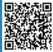
Inspire Health Referral Information