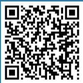
Inspire Health Referral Information