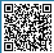
Inspire Health Referral Information

Office 559.323.9236 Referral Fax 833.973.6194