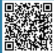
Inspire Health Referral Information

Downloadable Fax Referral Form inspirehealth.org/referrals