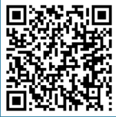
Inspire Health Referral Information

Internal Medicine Referral Fax 833.973.5631