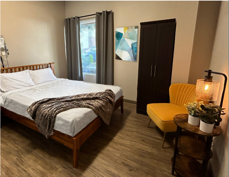
Photos: Overnight sleep study bedrooms